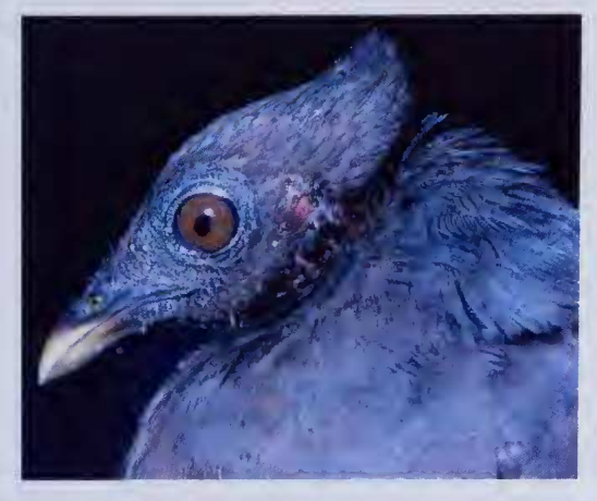
Figure 8 Dusky Scrubfowl Megapodius f. freycinet.

Common to very common. Mainly ones and twos occasionally small groups (up to five). Most numerous in beach vegetation especially on north end of island; also disturbed volcanic forest;